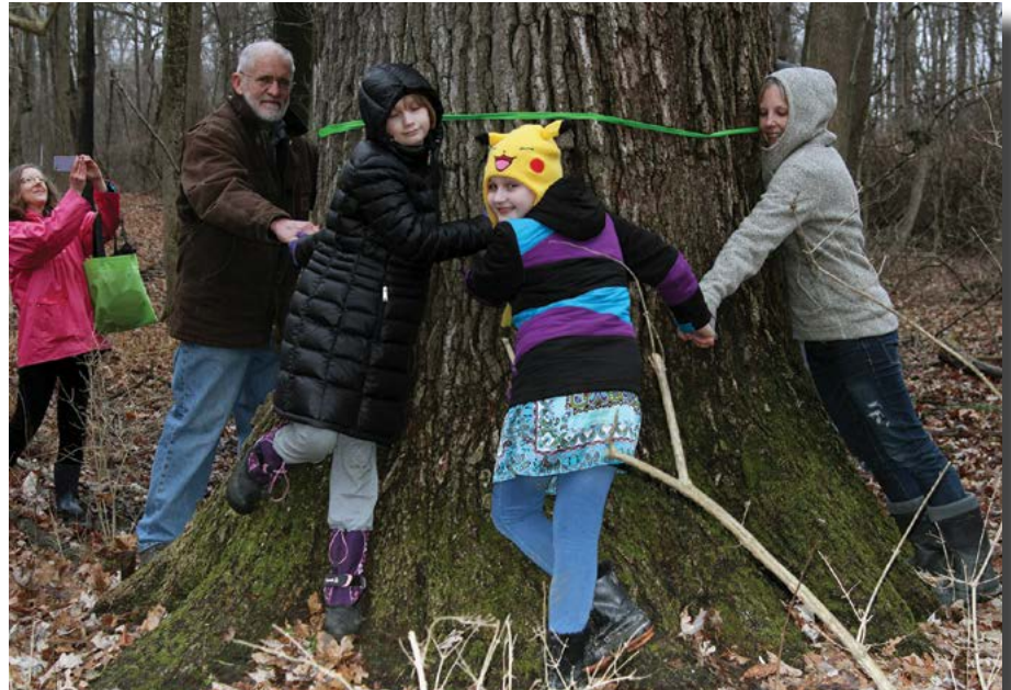
Tree huggers young and old embrace a giant at the candlelight vigil in January.

The biologists' report concluded that Crown Hill Woods "is a high-quality remnant of a once extensive forest that